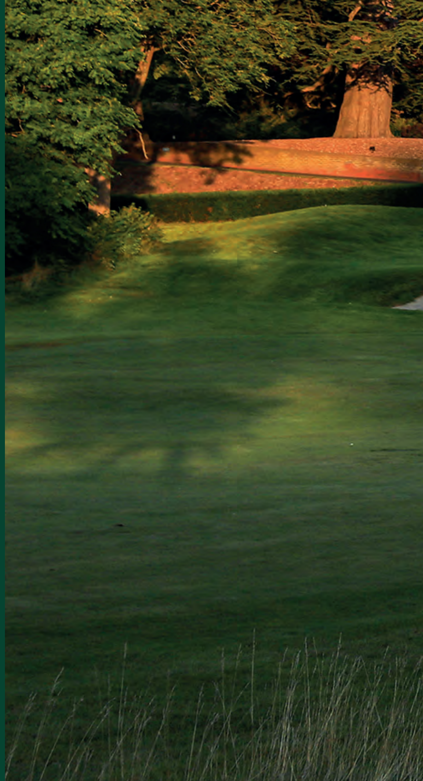
Image: 18th hole sweeping down to clubhouse.